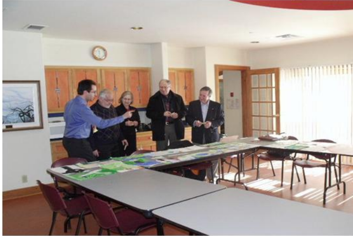
Panel of judges (left) who came together to take on the difficult task of judging artwork of the Creative Art Challenge 2010, February 1, 2010. Six winners from six different schools were selected.